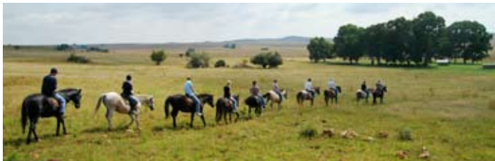
Before we headed home, we wanted to visit the fossil site on the N'gomo property. Known as Drimolen, it's an active dig in one of a number of sinkholes in the area

as who owned which property and what game was to be found on it. Suddenly we were over flower farms and chicken batteries full of caged fowls that could only dream of the freedom we were enjoying.